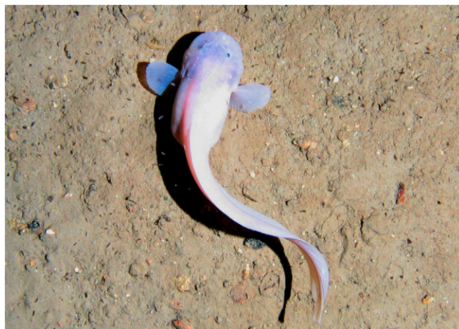
Fig. 1. The hadal snailfish N. kermadecensis (25). The image shows the snailfish alive at 7,199 m, photographed by baited camera close to the site where the samples were retrieved in this study (8). N. kermadecensis is endemic to the Kermadec Trench off New Zealand and occupies a very narrow depth band of 6,472 (24) to 7,561 m (8). The samples recovered for this study represent the second time this fish has ever been captured (the first time in 59 y) and represents the second deepest fish ever seen alive (7).

Tissue Integrity. Dorsal white muscle samples of the hadal snailfish were analyzed in several ways. We first tested for changes that might have occurred during the fish trap's 3 h 11 min ascent by analyzing water, sodium, potassium, and trimethylamine (TMA) contents. The muscles had a mean water content of 84.8 \pm 1.1\% (wt/wt), very similar to those in bathyal and abyssal species from 2,000–3,000 m (26). Sodium and potassium contents were 199 \pm 19 and 48.2 \pm 5.1 mmol/kg, respectively, differing considerably from seawater, which at 35 ppt has sodium and