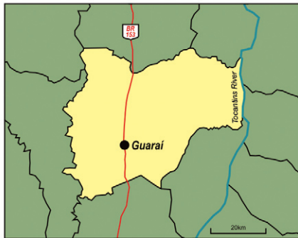
The municipality of Guaraí, state of Tocantins, Brazil.