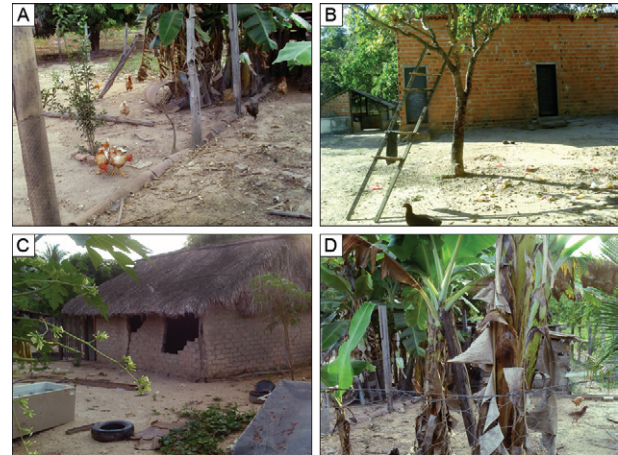
Monitoring stations (MS) in periurban area, municipality of Guaraí, state of Tocantins, Brazil. A, B: MS 3; C, D: MS 4.