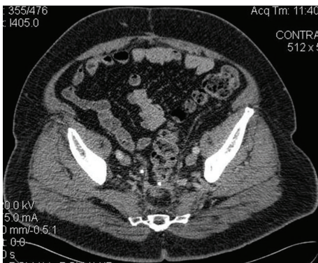
FIGURE 2: Computed tomography of the pelvis showing no evidence of extraureteral relapse.

lamina propria as well as in the perivesical adipose tissue. Neoplastic vascular plugs and carcinomatous perineural infiltration were also found. The neoplastic population was immunohistochemically positive for CK7, CK20, carcinoembryonic antigen (CEA), \beta -catenin, and p53. The surgical margins were free of neoplastic disease. Severe lymphatic inflammatory reaction without evidence of lymph node metastasis was found (pT3apNO). The patient died 6 months later due to toxic megacolon during chemotherapy.