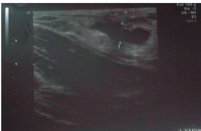
Fig. 2. Ultrasonography of the right axilla at first presentation, pre-surgical.

logical criteria sufficient to allow a species diagnosis, but permitted the diagnosis of the genus Dirofilaria . The laboratory results included a serological test. The serology was strongly positive using Dirofilaria immitis antigen, our normal test agent for all kinds of filariae. In addition, low titers were detected against Ascaris lumbricoides and Strongyloides spp. antigen. These are most likely to be interpreted as cross-reactions. The serological tests for Schistosoma spp. and Gnathostoma spinigerum were negative. In the peripheral blood, the count for eosinophilic leukocytes was only minimally raised (6%, normal < 4%). Fecal examinations using microscopy, Baermann technique, and culture were negative. Microfiltration of the blood at noon revealed no microfilariae in the peripheral blood. In an extended medical history, the patient revealed that she had stayed in Africa and Malaysia 6 months before the time of diagnosis. She had also suffered from fever and poor general condition 6 months earlier, after a trip abroad. The clinical examination conducted at that time, including blood samples and serology tests, had been without pathological findings.