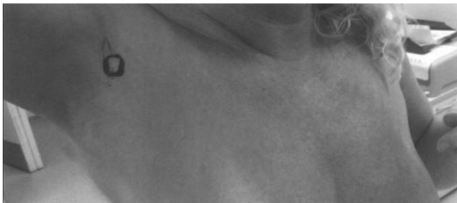
Fig. 1. Macroscopic view prior to excision.

A 55-year-old patient with a family history positive for breast cancer presented with a new-onset, subcutaneous, non-tender palpable mass in the right axilla. High-end ultrasonography showed a 1.3-cm, solid, singular encapsulated node (a B IV). Sonography of the breast on both sides, axilla and lymphatic drainage on the left side, lymphatic drainage on the right side, and mammography on both sides were without pathological findings (American College of Radiology, classification of breast density (ACR) II, B I) (figs. 1 and 2). The node was excised under local anesthesia as the patient refused minimal invasive biopsy. On histopathological examination, a severe granulomatous inflammation with massive eosinophilic infiltrates was found surrounding the tail of a parasite (figs. 3 and 4). A precise diagnosis of the filarial species was not possible because the parasite showed an advanced degree of disintegration. In addition, the cross-section of the worm at the level of the tail did not show morpho-