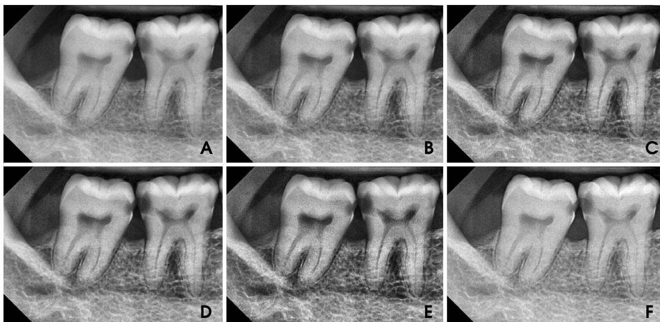
Fig. 2. Original and processed images. A. image enhanced by processing technique A. B. image enhanced by processing technique B. C. image enhanced by processing technique C. D. image enhanced by processing technique D. E. image enhanced by processing technique E. F. original image.

tic file for the diagnostic task of periapical lesions and endodontic files.