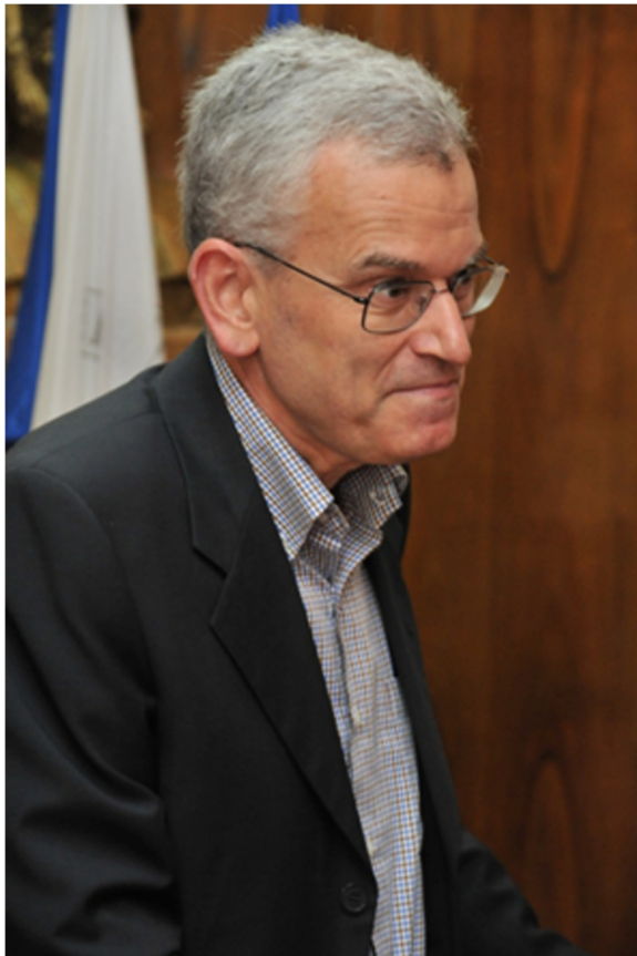
Figure 5 A port trait of Domenico Ribatti.

PlGF treatment inhibited wound healing, extravasation of tumor cells, and growth of a tumor overexpressing the PlGF receptor (VEGFR-1), neutralization of PlGF using blocking antibodies had no significant effect on tumor angiogenesis in different animal models.