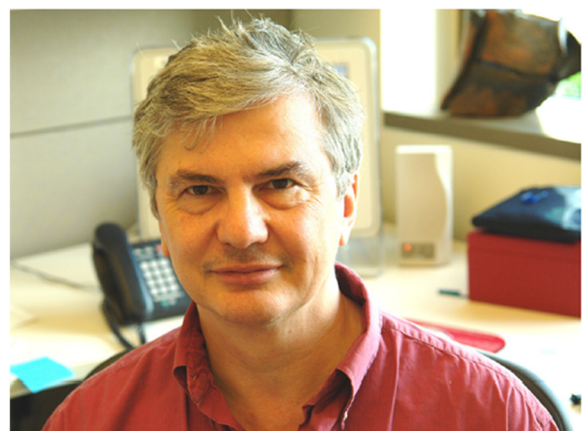
Figure 2 A port trait of Napoleone Ferrara.

generated an intense blue spot due to extravasated Evans blue, and called this activity VPF [16]. VPF showed a potency some 50,000 times that of histamine [17,18]. The molecular cloning of VEGF and VPF revealed that both activities are embodied in the same molecule.