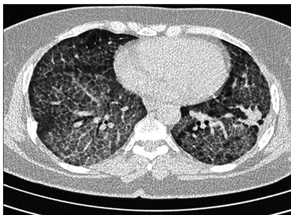
Figure 4. Axial HRCT image of a 40-year-old man with idiopathic PAP demonstrates bilateral widespread crazy-paving pattern and a mass-like consolidation in left lower lobe.

There was no statistically significant difference in HRCT presentations of PAP between age groups. All female patients (n=16) had crazy-paving, while 13 out of 19