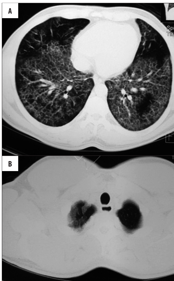
Figure 2. HRCT of a 30-year-old woman with idiopathic PAP presenting with chronic dyspnea and productive cough. Bilateral crazy-paving pattern is seen with subpleural (A) and left apex (B) sparing.

diffuse involvement of all lung zones (85.7%). Only 14.3% of patients had randomly spared upper or lower zones.