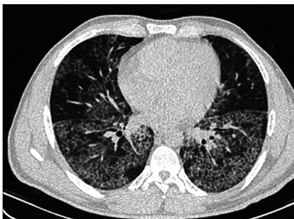
Figure 1. HRCT of a 38-year-old man with chronic dyspnea and cough and biopsy proved PAP demonstrating bilateral crazy-paving pattern with some geographic and subpleural sparing.

The overall extent of parenchymal involvement was 50 to 75% in eighty percent of patients, and 25 to 50% in twenty percent. The dominant distribution of disease was