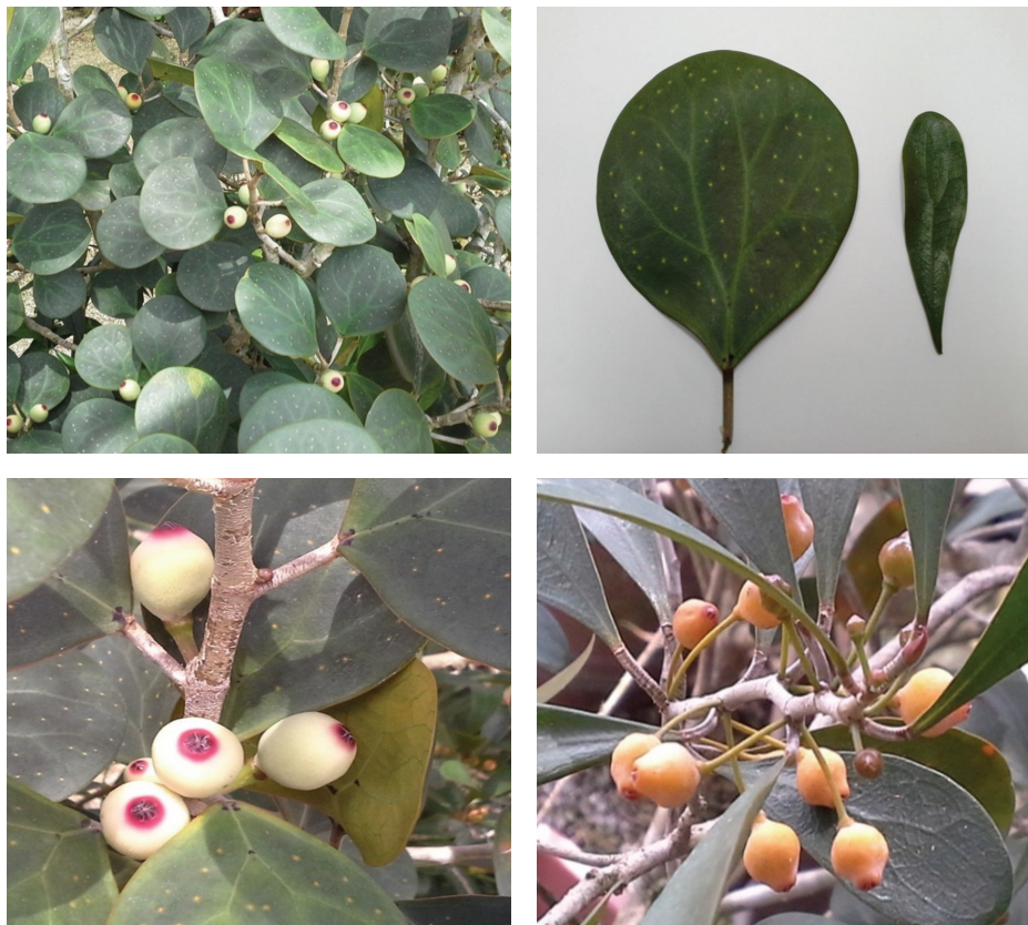
FIGURE 1: Ficus deltoidea commonly known as Mas Cotek in Malaysia.

F. deltoidea var. recurvata Kochummen, and F. deltoidea var. trengganuensis Corner [1].