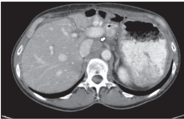
Figure 2: Abdominal computed tomography showing para-aortic lymph node recurrence (white arrow)

has been under regular clinical and radiological surveillance without evidence of disease recurrence.