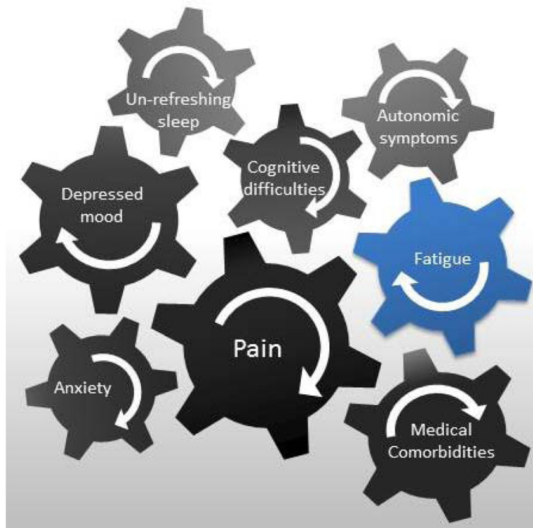
Figure 1 Association of fatigue and other fibromyalgia symptoms.

The search was performed using Ovid MEDLINE, Ovid EMBASE, and EBSCO CINAHL (Cumulative Index of Nursing and Allied Health Literature), covering 2000 through May 2013. The search strategy used controlled vocabulary (subject headings) and text words in the title