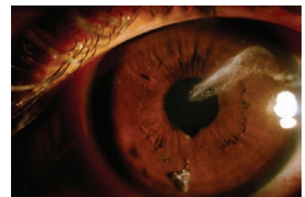
Figure 1. Slit lamp photograph of the left eye showing the corneal scar and the graphite pencil lead tip on the iris.

In our case, we decided to surgically remove the intraocular foreign body in spite of the fact that it had obviously remained in the eye for some time (as evidenced by the healed corneal scar and presence of iris atrophy) without inciting an inflammatory response or causing much damage to the intraocular structures. There was a distinct possibility of causing damage to the lens and inciting an inflammatory reaction during surgical removal of the foreign body. This risk had to be weighed