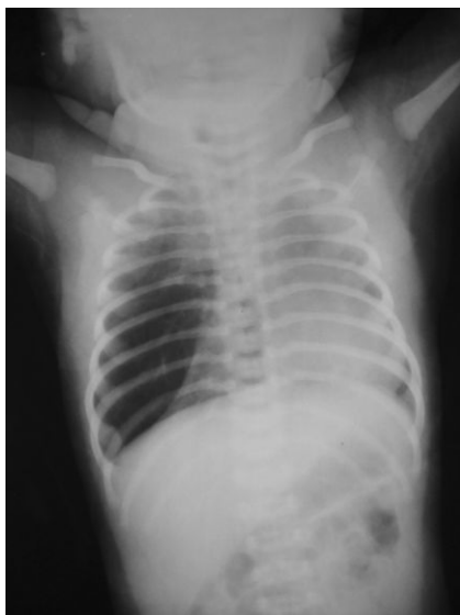
Figure 1. Chest X-ray showing atelectasis of left upper and middle lobes with hyperinflation of the right lung.

The diagnosis of CLE can be established by a combination of clinical, radiological, and histopathological features. The diagnosis can often be confirmed by a simple chest radiograph as an area of hyperlucency involving the affected lobe with collapse of the adjacent lung tissue, widening of the rib spaces, flattening of the ipsilateral diaphragm, and a mediastinal shift to the contralateral site. In cases where the emphysematous lobe is large, lung herniation to the contralateral hemithorax and atelectasis of the contralateral lung can be seen. CT scan is usually diagnostic in doubtful situations. In the present case, the collapse-consolidation of left upper and middle lobes were initially thought to be the primary pathology and hyperinflation of the right lung was thought to be due to compensatory emphysema. Failure to respond to antibiotic therapy only led to the use of CT scan. Other investigations, which can be done, to confirm CLE are