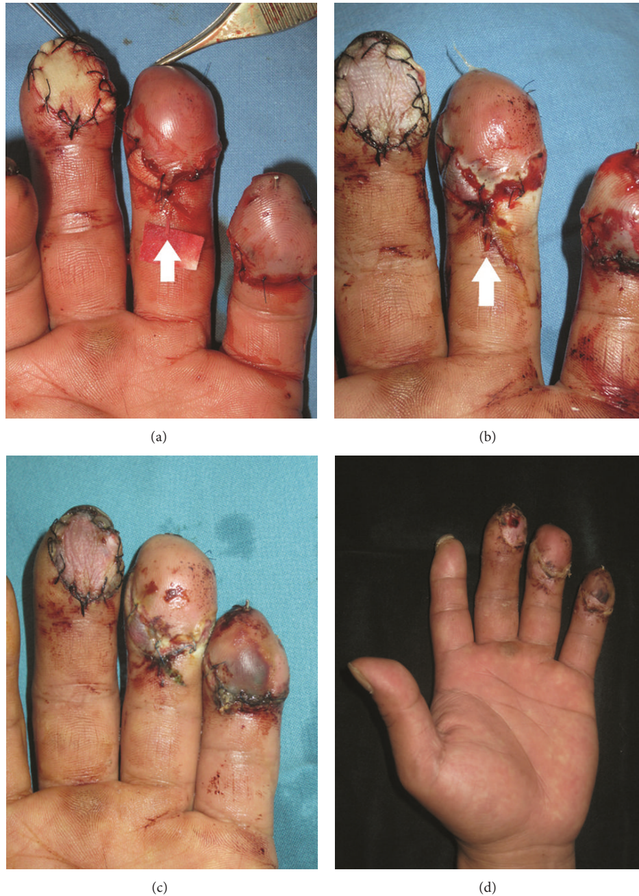
FIGURE 3: (a) Details of Case 2. (a) Immediate postoperative view. A full-thickness skin graft was done on the third finger, and the fifth finger was replanted via anastomosis of one artery and one vein. The mechanical leech procedure using an angioneedle (arrow) was performed on the fourth finger. (b) View on postoperative day 4. The angioneedle is located proximal to the amputated portion (arrow). (c) The patient was discharged on postoperative day 7. The angioneedle was removed on postoperative day 5, and all digits were reconstructed successfully. (d) 3 weeks after the operation. The patient was encouraged to exercise and had gone back to his normal daily routine.

ite graft, there is limited success in children, not in adults, and the results are unpredictable. Restoration of circulation by microsurgical anastomosis is the only method that ensures success [8].