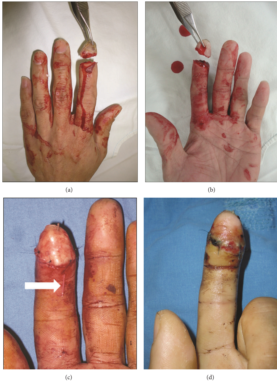
FIGURE 2: Details of Case 1. (a) and (b) A 46-year-old man amputated his left second finger just distal of distal interphalangeal joint. The patient had history of blunt trauma with a hammer to the same finger leaving the amputation site scarred and atrophied. (c) Immediate postoperative view. The angioneedle is located proximal to the amputated portion (arrow), which was anastomosed to the branch of central artery and functioned as a conduit for venous drainage. (d) View on postoperative day 8. The digit was replanted successfully.

performed. The skin defect on the third finger was repaired with a full-thickness skin graft from the ankle. Replantation was performed on the fifth finger with anastomosis of one artery and one vein. There were no viable veins in the fourth finger, so the mechanical leech procedure was performed (Figure 3(a)). After the surgery, the catheter was flushed with heparinized saline once per hour, and heparin was continually administered intravenously over 3 days. The catheter was maintained for 4 days and removed on postoperative day