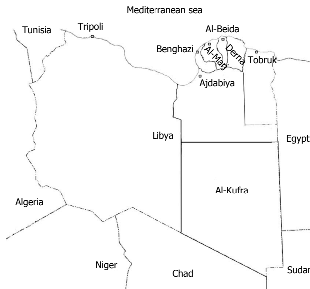
Figure 1 Map of Libya highlighting the districts that were studied and included in the eastern Libya cancer pool.

The study was approved by the Biomedical Ethics Committee at the Libyan International Medical University. All