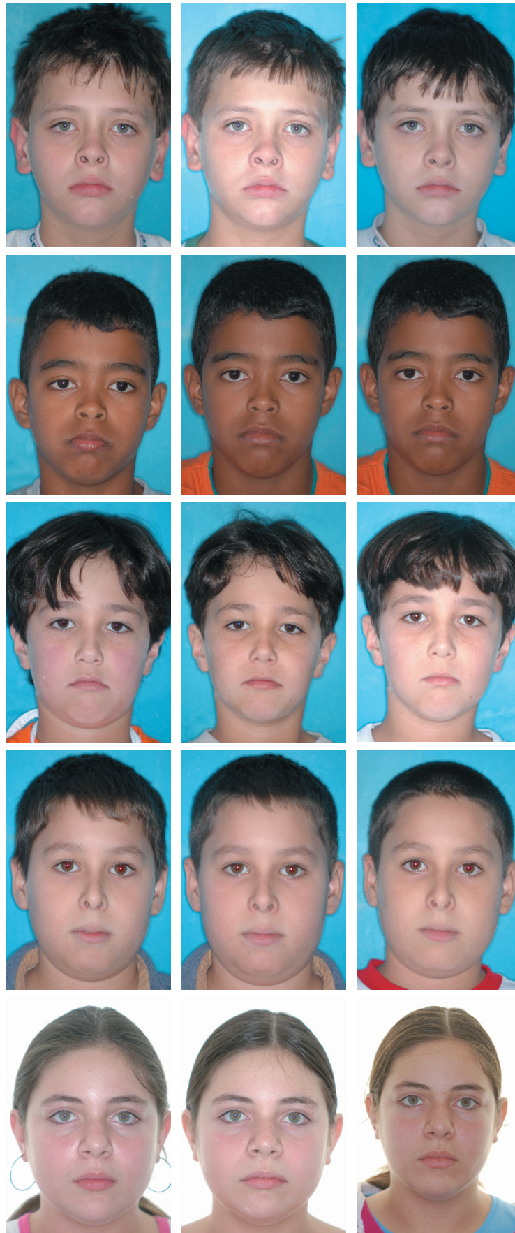
Figure 2- Frontal facial photograph of five patients in the pre-expansion period, immediate post-expansion period and 1 year following expansion (from left to right, respectively; parents signed informed consent authorizing the publication of these pictures)