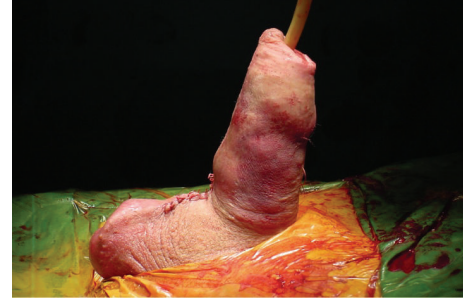
FIGURE 3: After having adjusted the tension of the second row of plication sutures, complete penile straightness with a fully inflated penile prosthesis is seen.

Postoperative course was uneventful and the patient was discharged on postoperative day 2. The patient was scheduled for our standard 6-week training period to learn