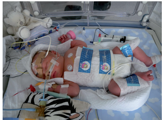
Fig. 2. — Clinical setting of hypothermia. Total body cooling using the Criticool device.

A second (Shankaran et al., 2005) and third (Azzopardi et al., 2009) large clinical trial successfully used whole body hypothermia , with a target temperature between 33 and 34°C. Although seemingly simple to implement, the lowering and maintenance of the core temperature during 72 hours is complex. Different commercial devices are now in use for whole body hypothermia, with servo-controlled systems aimed at reducing fluctuations in body temperature, being most desirable. Such systems are also helpful in avoiding hyperthermia during rewarming after hypothermia (Fig. 2).