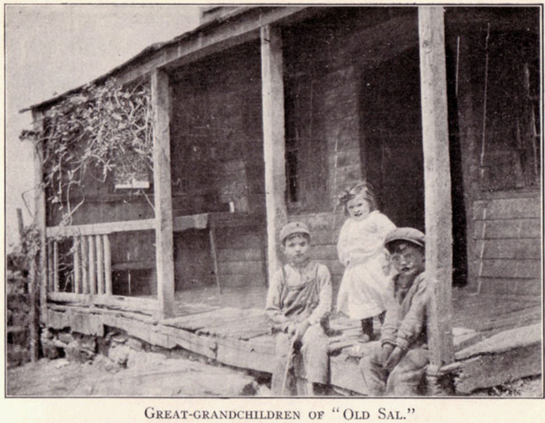
Figure 6. Great-grandchildren of "Old Sal" (from The Kallikak Family , p. 88).