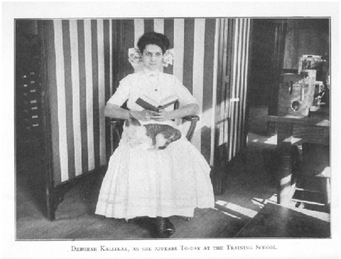
Figure 1. “Deborah Kallikak” as pictured in the frontispiece of The Kallikak Family . (Photograph in public domain).