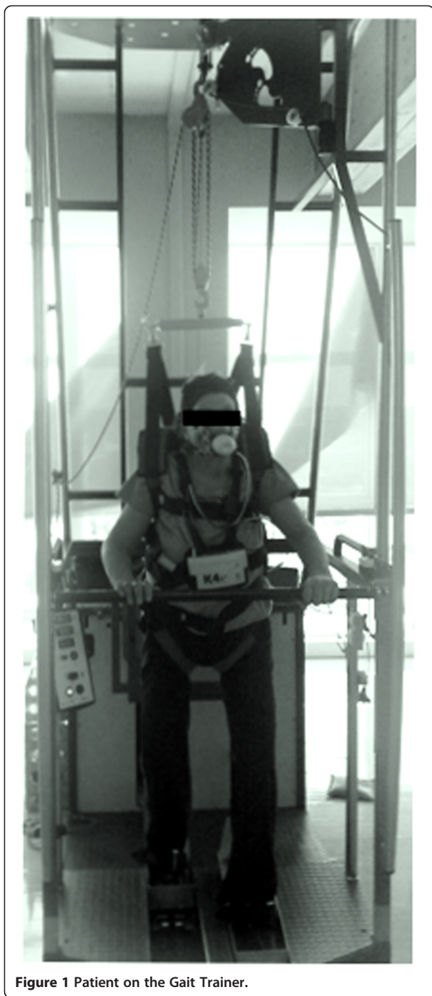
Figure 1 Patient on the Gait Trainer.

performance: ventilation ( V'E l/min), oxygen consumption ( V'O_2 ml/kg/min), carbon dioxide production ( V'CO_2 ml/kg/min), respiratory exchange ratio (RER, i.e. V'CO_2/V'O_2 ), heart rate (HR beats per minute- bpm) and walking speed (m/min). For the OWT, mean walking speed was calculated as the ratio of distance to time; thus, the walking speed obtained in the last 2 min of data collection was considered. Finally, as an index of the exercise intensity