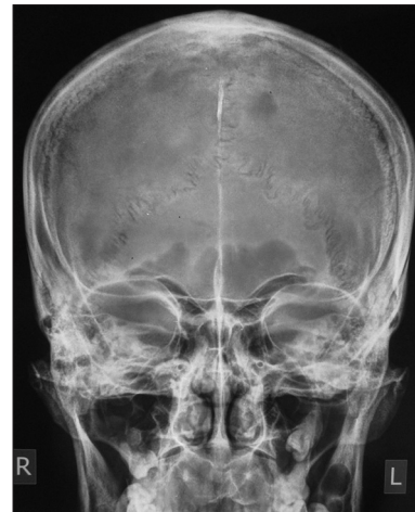
Figure 5: Postero-Anterior skull with calcification of Bilamellar falx cerebri

Multiple OKCs usually occur as a component of NBCCS or GGS, Oro-facial-digital syndrome, Noonan syndrome, Ehler-Danlos syndrome, Simpson-Golabi-Behmel syndrome. [8] In our case, clinical and radiological features were not in concordance with any other syndromes except GGS.