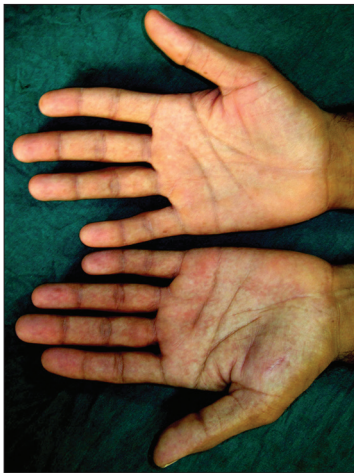
Figure 2: Palmar pits in both hands