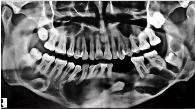
Figure 4: Orthopantomogram with multiple multilocular radiolucent lesions in the maxilla and mandible

Clinically this condition is characterized by different signs and symptoms. Diagnosis is based on the most frequent and specific features of the syndrome as given by Evans et al. in 1993. [5] Diagnosis of GGS can be established when two major or one major and two minor criteria are present. [5-7]