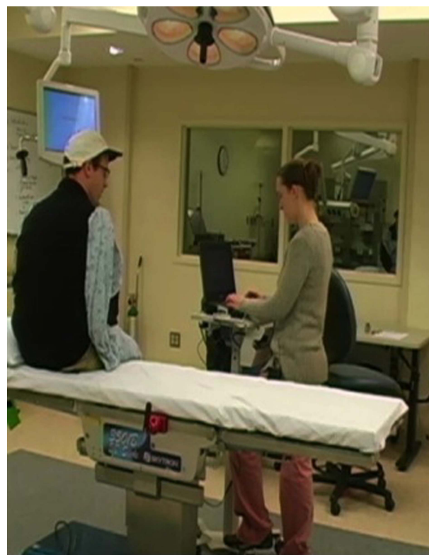
Figure 2 Participant gathering patient history and entering electronic clinical documentation using a workstation on wheels during a simulated patient encounter.