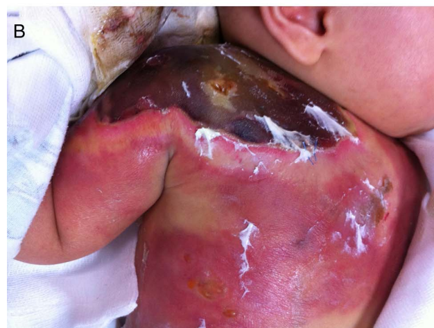
Figure 1 Pictures of necrotising enteritis and ecthyma gangrenosum. (A) Widespread patchy necrosis with fibrin coating on the small intestine. (B) A huge and extensive ecthyma gangrenosum.

10 had multiple sites affected. Seven patients (26%) had seizure; all of them had hyponatraemia. Two had meningitis with subsequent obstructive hydrocephalus. Both eventually developed severe chronic neurological sequelae, including brain atrophy and hydrocephalus.