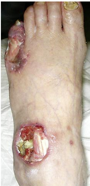
Fig. 1. Clinical appearance of the ulcer 2 months later. The ulcer on the fifth toe had expanded with surrounding small erythematous, bullous lesions, while the ulcer on the dorsum had exposed the joint capsule.