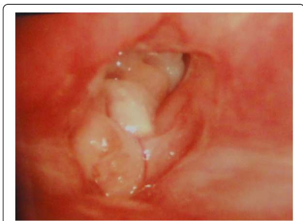
Figure 1 Laryngoscopic view. Exophytic masses involved the whole length of the right vocal cord and reached the anterior commissure and front of the left vocal cord.

IMT involving the larynx is rare, especially in the pediatric age group. To date, only eight cases of childhood laryngeal myofibroblastic lesions have been reported in the literature in English: four cases diagnosed as IMT and four as inflammatory pseudotumor (IPT) [4-11]. The mean age of these patients is 5.7 years (range of 2.5 to 10 years), and the male-to-female ratio is 7:1. Dyspnea and stridor are the most frequently reported symptoms, whereas hoarseness (which is more common in adult laryngeal IMTs) is seen in only two cases, who are relatively older. The mean symptom duration is 3.9 months (range of 0.5 to 6 months) [4-11]. Most cases generally involve the subglottic region, and only one involved the vocal cord. The majority of the lesions are nodular or polypoid, and one case mimicked papillomatosis [5]. The lesions rarely recur after tumor resection, showing benign behavior, except for one report of a