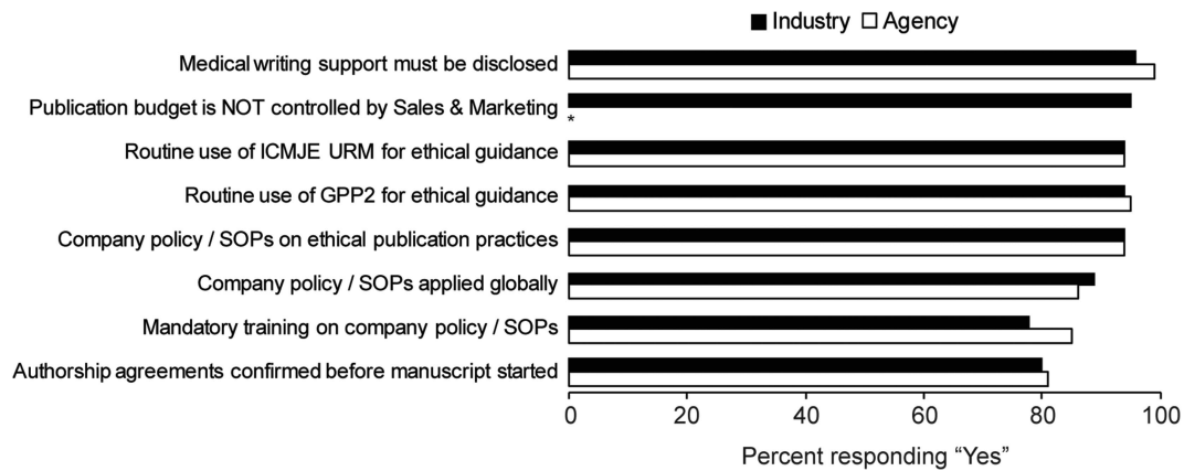
Figure 1 Percentage of survey respondents from industry and agency groups responding 'yes' to selected questions.

Respondents kept up-to-date on current guidelines primarily via training provided by their organisation (64%), from professional associations (68%) and monitoring the literature (70%).