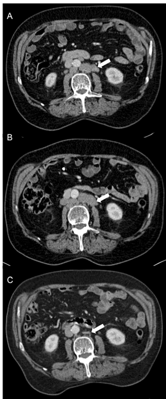
Figure 2 Serial abdominal computed tomography scans.

(A) Baseline computed tomography scan performed 3 days prior to the start of chemotherapy. Bulky retroperitoneal lymph nodes are visible (arrow). (B) End-of-treatment computed tomography scan performed 28 days following the last dose of chemotherapy. The lymphadenopathy persists (arrow) and was deemed stable by Response Evaluation Criteria In Solid Tumours criteria. (C) Follow-up computed tomography scan, performed 203 days following the last dose of chemotherapy. This scan was requested in view of the dramatic fall in PSA. Complete resolution of the lymphadenopathy is observed, with only a small residuum left (arrow).