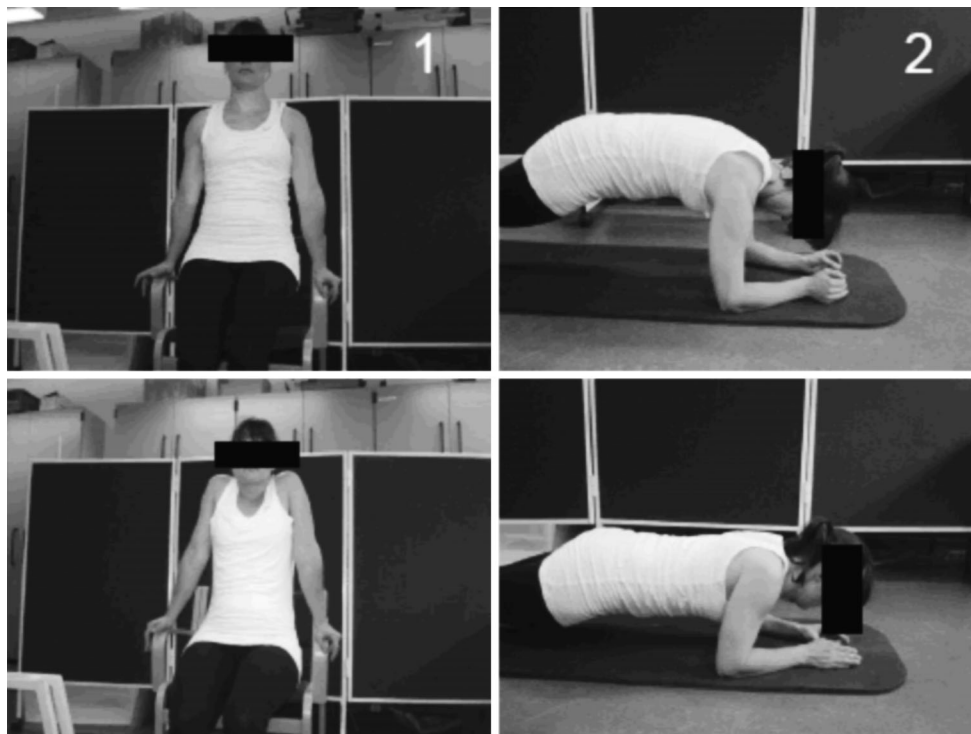
Fig. 2 The two exercises used in the intervention (1) press-up and (2) push-up plus

PPT was measured in the following sites; (1) the muscle belly of the upper trapezius identified by palpation around the midway point between C7 and acromion -as this muscle is often a site of pain in neck/shoulder cases; (2) the muscle belly of the lower trapezius identified by palpation 2/3 down between angulus superior and the spinal attachment—as this muscle was directly trained; (3) middle part of the sternum –non-muscle reference; and (4) the muscle belly of the tibialis anterior—as a non-related muscle reference.