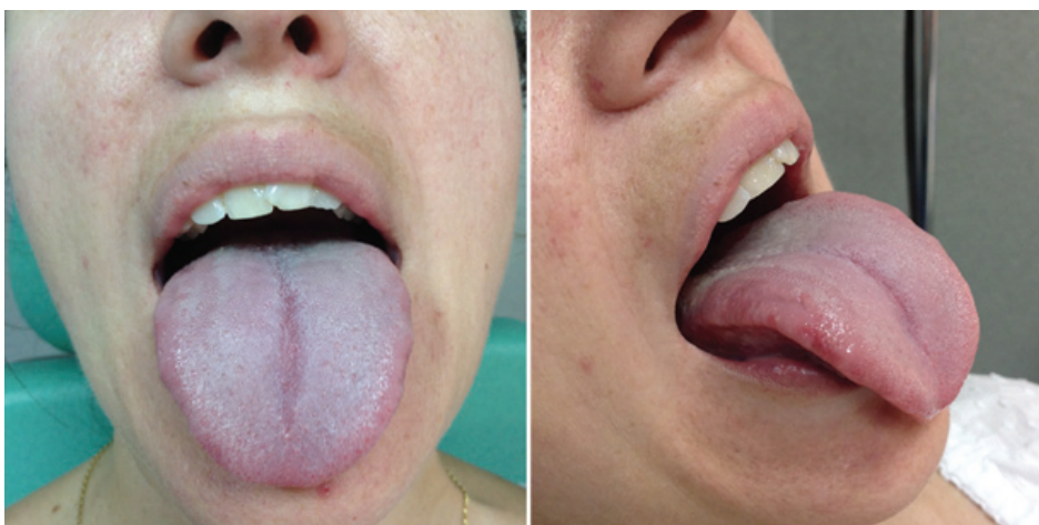
Fig. 2. 6th month post-removal. A decrease in fungiform atrophied area was observed despite the persistence of bites signs.

recommend inserting the needle parallel to the medial mandibular branch to get a lateral relationship with the lingual nerve during the blockade in order to reduce the number of direct nerve injuries and/or anesthetic intrafascicular infiltration (25). Likewise, the depth and/or location of the suture used to close the wound may cause lingual nerve entrapment or direct injury. Finally, the disto-angular position involved the need for a distal osteotomy and lingual flap elevation to perform the extraction properly.