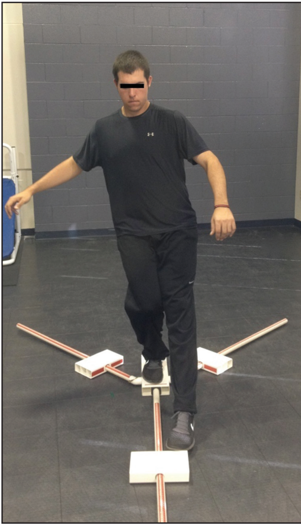
Figure 1. Y-Balance Test-Lower Quarter, anterior reach direction.