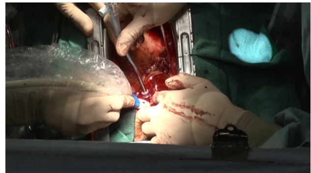
Fig. 3 A 16-French, heparin-coated, flexible, thin-walled cannula (Fem-Flex II Femoral Arterial Cannulae; Edwards Life Sciences LLC, Midvale, UT, USA) was inserted into the aorta using Seldinger technique

inserted through the right superior pulmonary vein, and systemic cooling was started immediately. Myocardial protection was obtained by means of retrograde infusion of cold blood cardioplegia. If an intimal tear was found in the ascending aorta or proximal transverse aorta, replacement of the ascending aorta or hemiarch was performed using an open distal anastomosis under circulatory arrest with retrograde cerebral perfusion. In cases in which an intimal tear was found in the transverse aorta, total arch replacement was performed to exclude intimal tear. We use selective antegrade cerebral perfusion whenever total arch replacement is required.