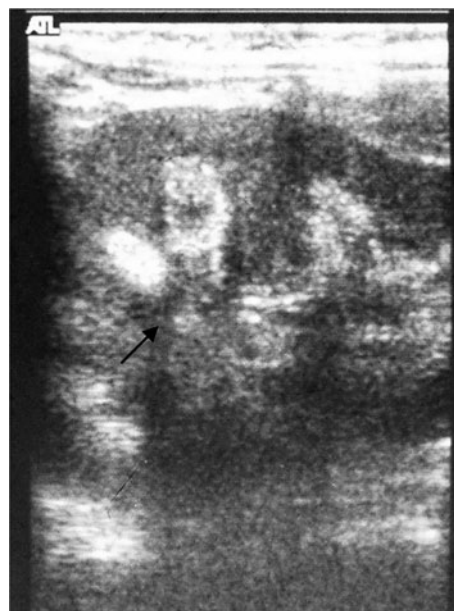
Fig. 3 Ultrasonography of left kidney (size 7.2 by 3.9 cm) 42 mon after initial episodes showing persistence of medullary nephrocalcinosis with acoustic shadow (black arrow).

was made and the patient was scheduled for a month of calcitonin injection every other day. His serum calcium decreased progressively and normalized in 3 mon. The patient otherwise showed absolutely normal growth and developmental milestones. A follow up visit 42 mon later revealed normal serum calcium, urinary calcium/creatinine ratio. However, ultrasonography demonstrated no reduction in the nephrocalcinosis (Fig. 3).