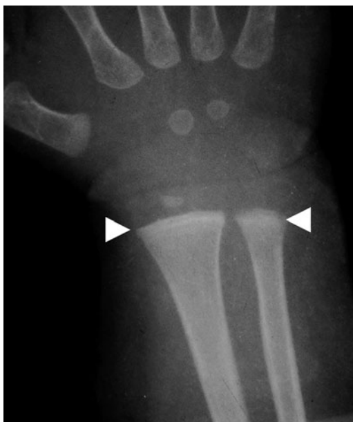
Fig. 2 Hand X-rays showing dense lines at the end of radius and ulna (white arrowheads).