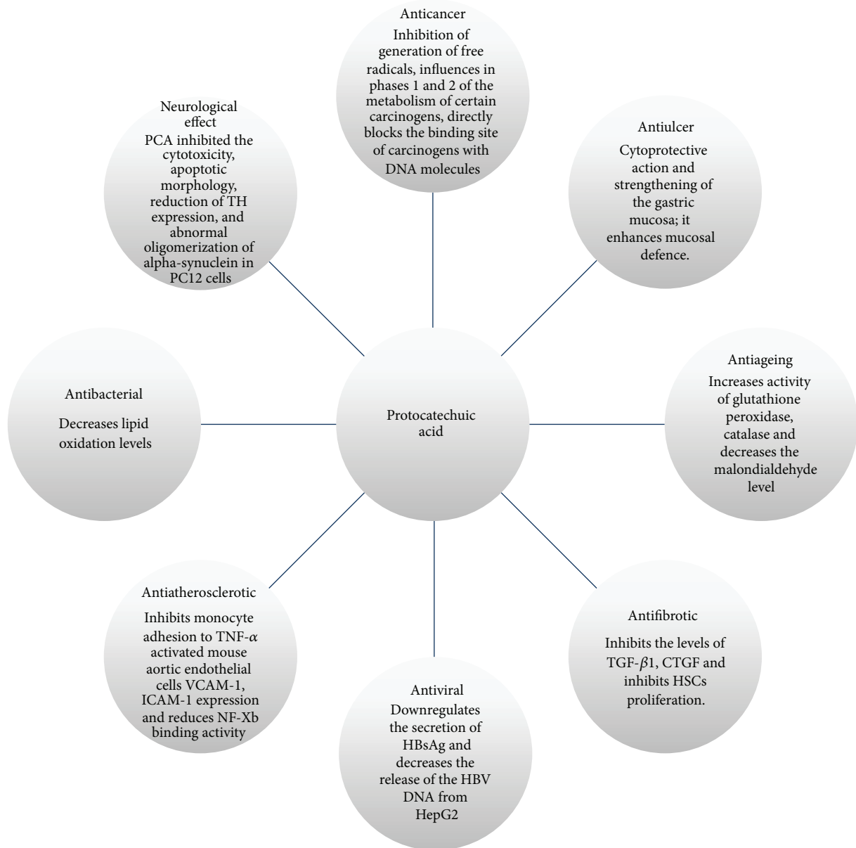
FIGURE 2: Pharmacological activity of protocatechuic acid.

6.3. Antidiabetic Activity [29]. Protocatechuic acid at 1% and 2% when given to d-galactose treated mice for 8 weeks decreased reactive oxygen species levels, protein carbonyl, carboxymethyllysine, pentosidine, sorbitol, fructose, and methylglyoxal. PCA also shows anti-inflammatory properties in this regard by decreased release of interleukin (IL)-1 beta, tumor necrosis factor-alpha, and prostaglandin E2 in brain. Protocatechuic acid might be helpful for the prevention or alleviation of ageing due to prevention of brain inflammatory and glycation injury. PCA at 2% or 4% when supplied to diabetic mice for 12 weeks was useful in preventing glycation-associated diabetic complications.