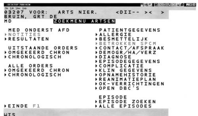
Figure 3. Dutch translation of the TDS7000 system screen. This menu screen allows doctors to see standing orders and patient data. Under the heading "Patientgegevens" (patient data), the last arrow is a reference to the DRG-like classification scheme (DBC's) that became mandatory in Dutch hospitals as of January 1, 2004. Note the coarseness of the system emulation compared with the finesse of the Windows environment (see Windows task bar).

In reality, the implementation had a drastic impact on the organization. Soon after the implementation, clerical users found that retrieving and entering patient data took much more time because each screen would allow them to handle only a limited amount of data. For most tasks, many more screens now had to be worked through. Also, when making typing errors, they had to go back in the pathway and redo a part of the transaction or even the whole transaction.