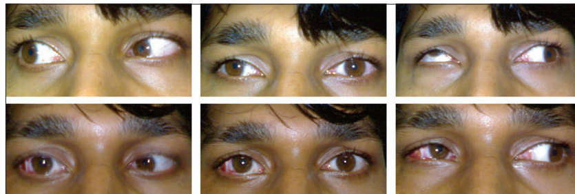
Figure 1: Case A6: Right exotropic Duane retraction syndrome before (top) and after (bottom) right lateral rectus periosteal fixation showing the correction of exotropia, improvement in adduction and better retraction control

Abduction and adduction improved significantly in both groups. For abduction in group 1 the mean abduction changed from -3.8 to -3.6 P = 0.007 (median changed from -4 to -3.5 ) and mean adduction changed from -1.9 to -0.7 , P = 0.002 (median changed from -1.5 to -0.5 ). In group 2, the mean abduction changed from -3.6 to -2.8 P = 0.001