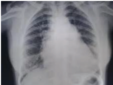
FIGURE 2: Cardiomegaly and increased pulmonary vascular markings.

left parasternal systolic lift, fixed splitting of the second heart sound, and a systolic murmur of grade IV/VI at left parasternal area.