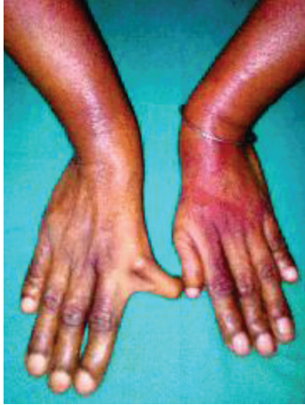
FIGURE 1: Rudiment thumb and little fingers with adductor deformity of both wrists.