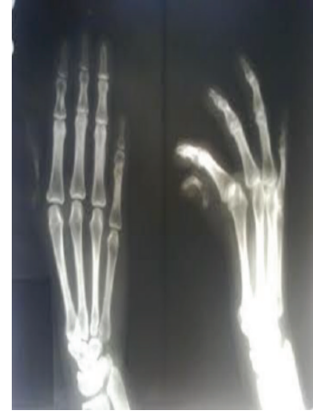
FIGURE 3: Absent first metacarpal bone of the left hand, underdeveloped distal phalanges of thumb and the little finger of both hands.

Electrocardiogram showed normal sinus rhythm with right ventricular hypertrophy with right axis deviation. Chest X-ray poster anterior view showed levocardia, cardiomegaly mainly of right atrium and the right ventricle, increased pulmonary vascular markings, and normal thoracic situs (Figure 2). Plain radiograph of both hands revealed absence of first metacarpal bone of the left hand, and underdeveloped distal phalanges of thumb and the little finger of both hands (Figure 3). Two-dimensional echocardiography showed ostium secundum atrial septal defect (Figure 4). Renal ultrasound and kidney function tests were normal. She was stabilized with medical management and underwent the complete intracardiac repair with pericardial patch closure of the septal defect under cardioplegic arrest on the second day of admission. On followup for the last two years, she is doing well and is asymptomatic regarding her cardiac symptoms without any medical therapy.