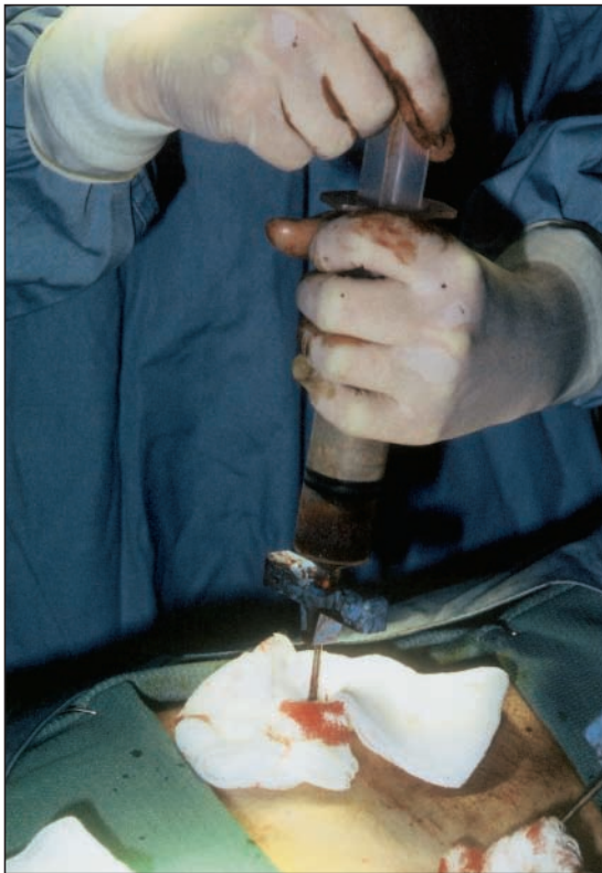
Fig. 1: Collection of stem cells by direct aspiration from bone marrow, with the donor under general anesthetic.

The actual transplantation of the cells is a simple process involving intravenous infusion of a liquid stem cell product through a large-bore central venous catheter over 1 to 2 hours. The stem cells are then able to travel or “home” to the bone marrow cavity to re-establish hematopoiesis over the next 2 weeks. 12 It is the care of the patient after transplantation that can present much more of a challenge to the multidisciplinary care team, especially in the setting of allogeneic transplant. In this article we aim to familiarize primary care practitioners with some of the basics of allogeneic and autologous transplantation, as well as issues relevant to the care of transplant recipients over the short and the long term.