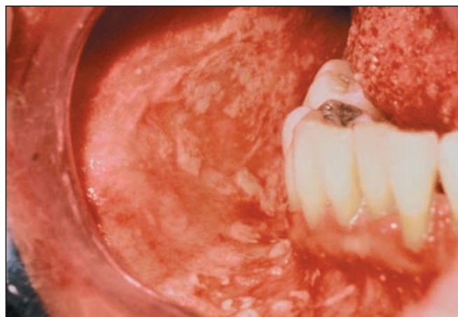
Fig. 6: Oral lichenoid mucosal reaction and periodontal disease, occurring as part of graft-versus-host disease.

‡Discontinue when patient has been off immunosuppressive drugs for 12 months.