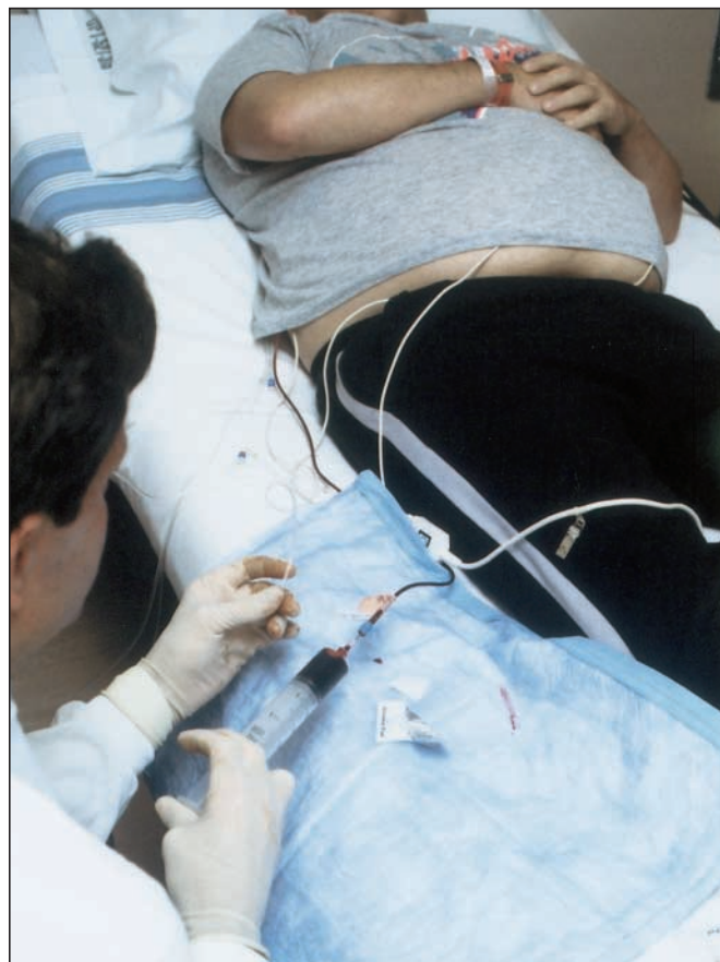
Fig. 5: Patient receiving infusion of autologous stem cell preparation.

Chronic GVHD is a syndrome unique to allogeneic stem cell transplantation, with manifestations resembling those seen in autoimmune disease (Fig. 6). The highly variable findings may include oral and ocular changes (sicca syndrome), cholestatic hepatic dysfunction and cutaneous scleroderma (Box 6). 30 Chronic GVHD occurs in at least half of HLA-identical sibling transplants, and its presence is a major risk factor for infection. 31 Treatment of chronic GVHD usually begins with a combination of corticosteroids and cyclosporine for a minimum of 6 months, with the use of immunosuppressive drugs further increasing the risk of infectious complications. 32