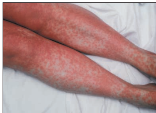
Fig. 4: Rash of graft-versus-host disease.