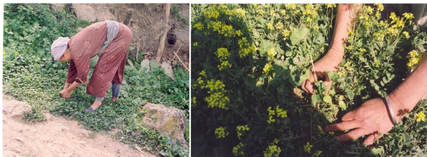
Figure 2 Collecting WLVs (left: collection Malva spp. Izara, Taounate, right: Malva spp. in Sidi Sinoun, Taounate).

“Cultural transmission is the process of acquisition of behaviours, attitudes, or technology through imprinting, conditioning, imitation, active teaching and learning or