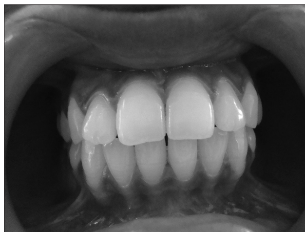
Figure 2: Clinical picture of gingival status in a male epileptic patient before the start of phenytoin therapy, after 1 week of oral prophylaxis