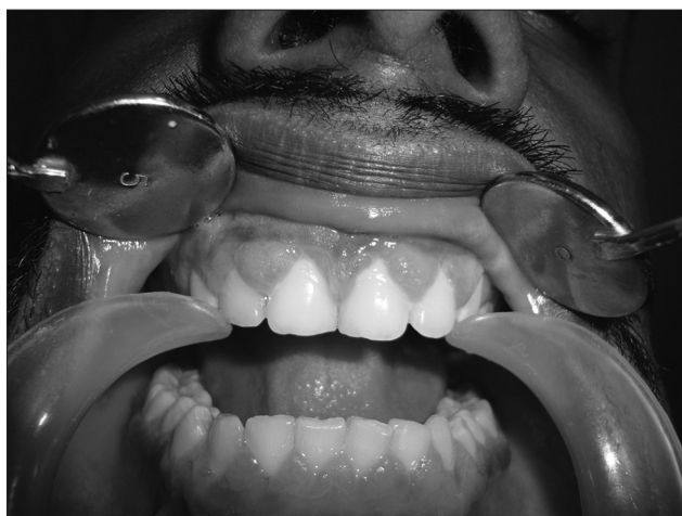
Figure 4: Clinical picture of gingival enlargement in a male epileptic patient (Grade 2) after 6 months of phenytoin therapy

Average serum folate level in the test group in our study was 7.68 \pm 2.11 ng/mL prior to the start of phenytoin therapy