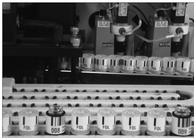
Figure 1: Immulite 1000 system, Siemens REF LKFO1, lot 0305, SMN 10380902 equipment for assessment of serum folic acid levels by chemiluminescent immunoassay system with running samples

After 3 [Figures 3-5] months, the patients were reviewed and their gingival scores re-assessed using the same criteria. The same procedure was repeated at the end of 1 year [Figure 5] of phenytoin therapy and serum folic acid levels assessed before the morning dose of phenytoin. Results were tabulated and subjected to statistically analysis.