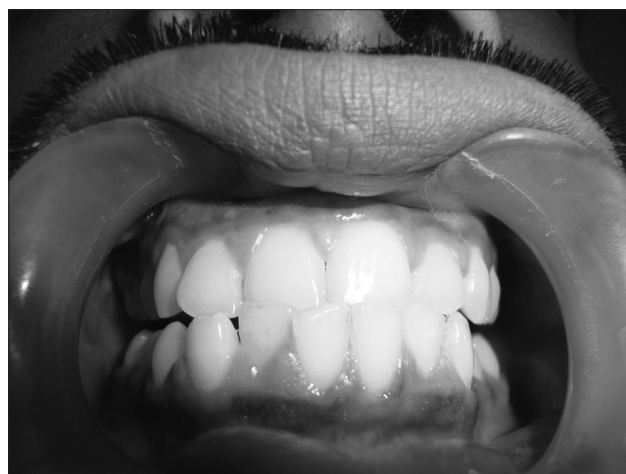
Figure 3: Clinical picture of gingival enlargement in a male epileptic patient (Grade 1) after 3 months of initiation of phenytoin therapy