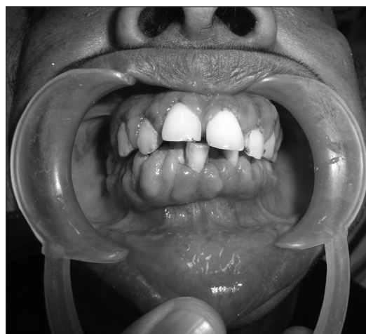
Figure 5: Clinical picture of bulbous gingival enlargement in a female epileptic patient with more prominent involvement of the interdental papillae (Grade 3) after 1 year of phenytoin therapy