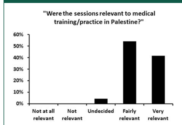
Figure 2. Participant perception of the relevance of OxPal teaching.

inadequate time to prepare the tutorial; this should be addressed in the future. Students were universally acknowledged as keen and enthusiastic and their theoretical knowledge considered particularly strong. Due to the inherent nature of a text-based chat interface, it was sometimes difficult to engage all students simultaneously.