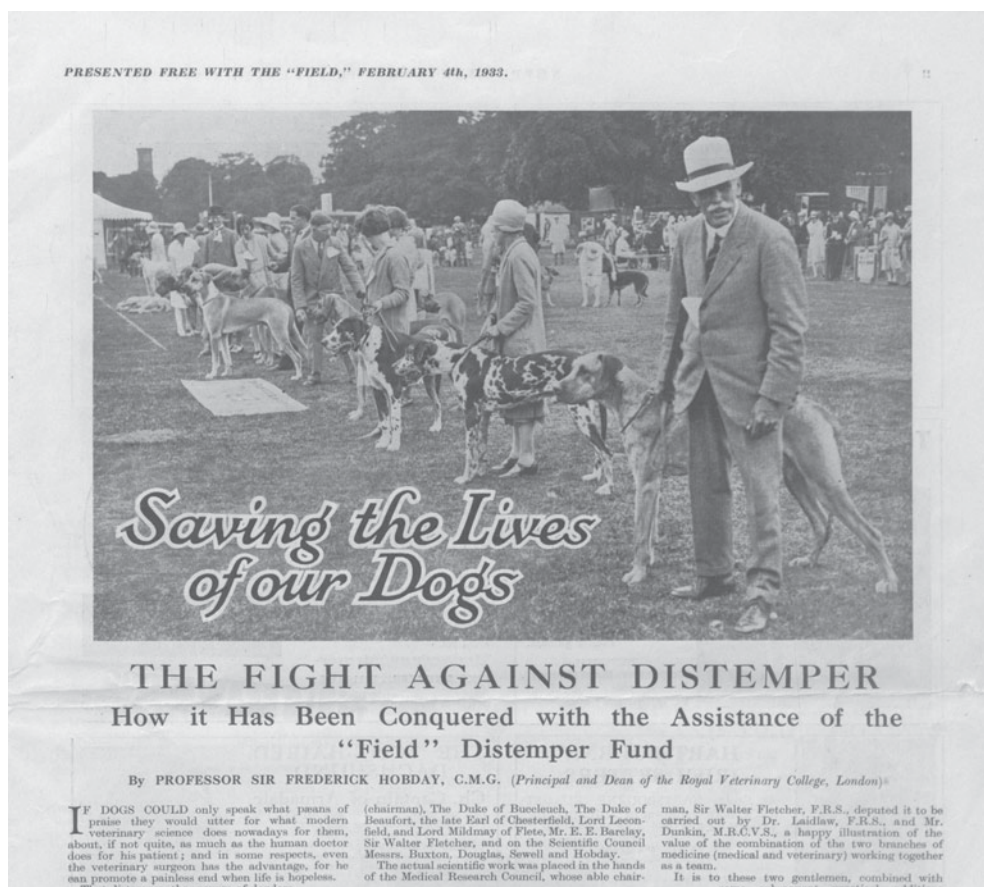
Figure 1. The cover of the special issue of The Field celebrating the introduction of dog distemper vaccines. 'Saving the lives of our dogs', The Field , 4 February 1933, p. 1.