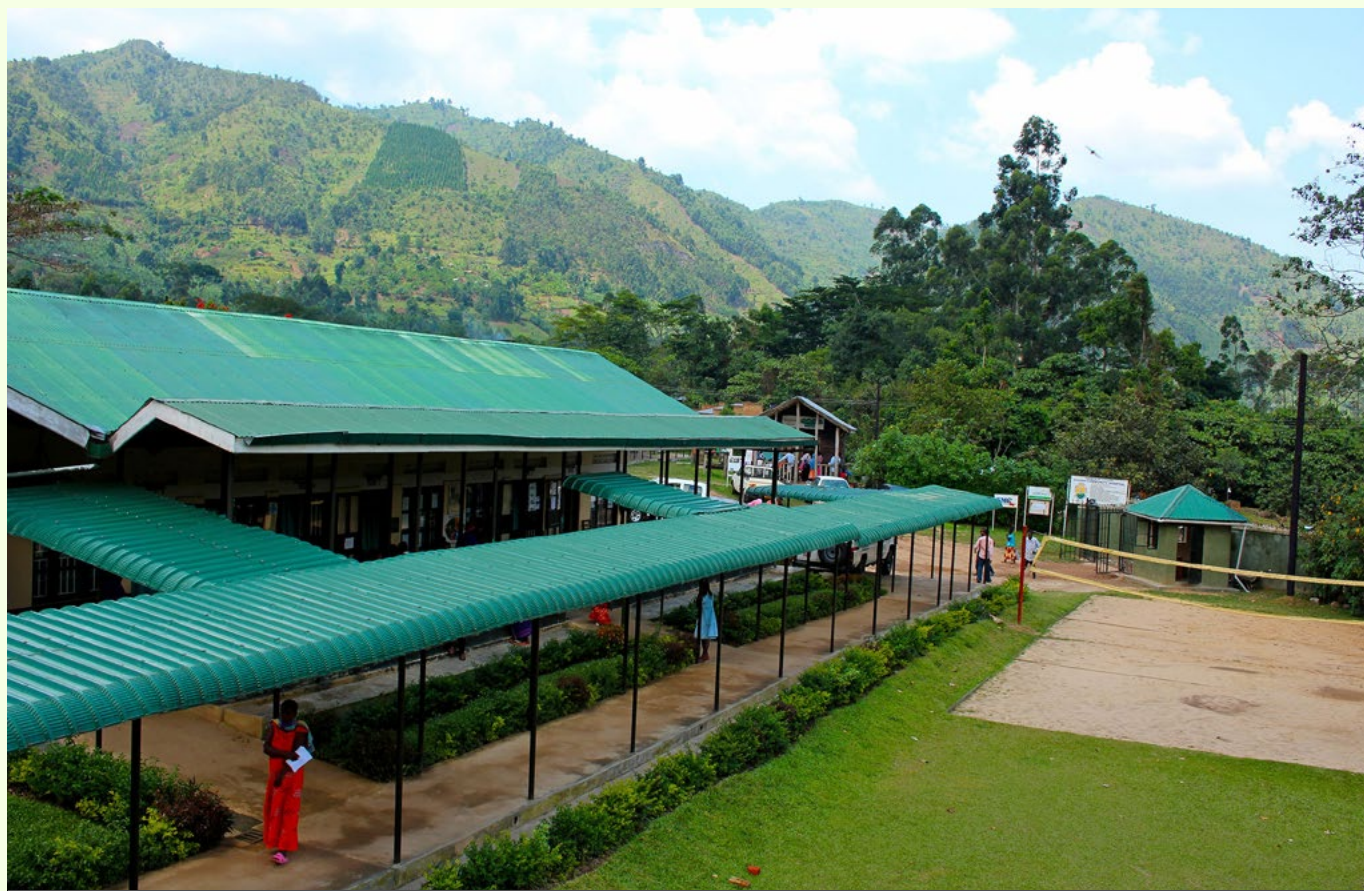
Bwindi Community Hospital, in the village of Buhoma just outside Bwindi Impenetrable National Park, serves more than 100,000 villagers in the surrounding area. Founder Scott Kellermann says the hospital's outreach efforts address the region's poverty, health, and conservation ailments in a holistic way.

The Batwa have always treated their illnesses with medicinal herbs, hunted wild game, and harvested honey to survive. But when the park was first established, those activities became illegal; people lost a means of sustenance, 27,28 and today, accessing forest products is prohibited without a permit.