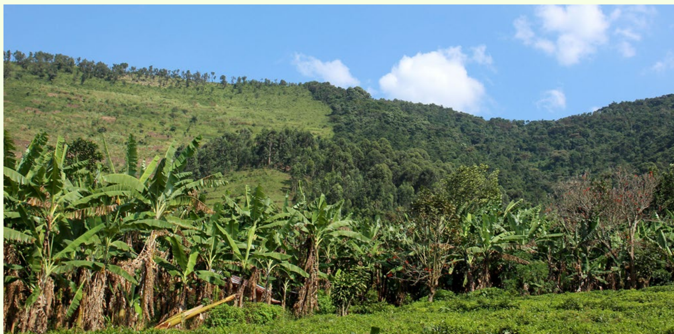
A hard edge exists between Bwindi Impenetrable National Park, home to the famous mountain gorillas, and the agricultural lands and homesteads surrounding it.

The Kibale EcoHealth project has expanded beyond empirical research to implementing practical solutions to local