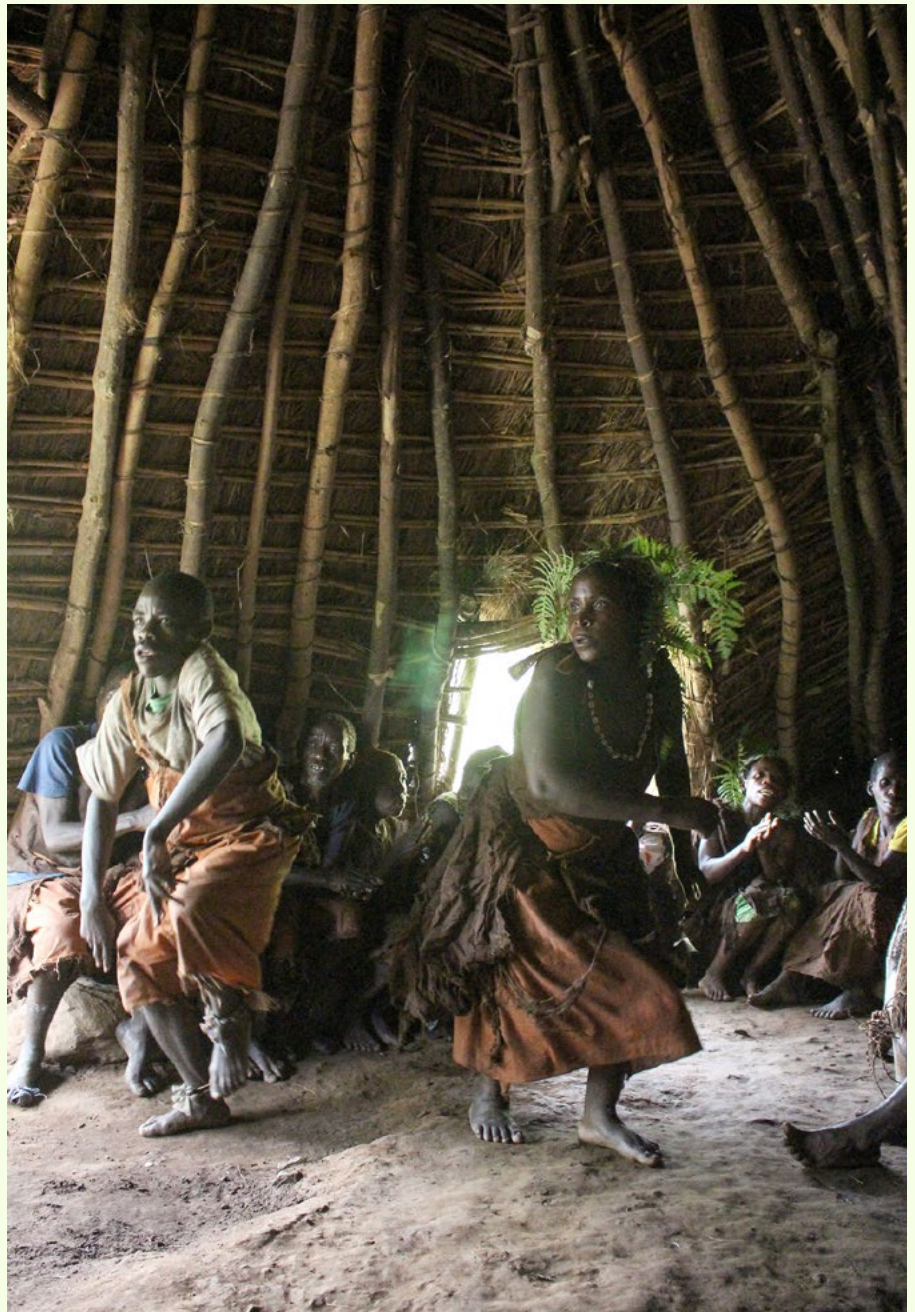
The Batwa are “conservation refugees,” evicted from their traditional home with the 1991 establishment of Bwindi Impenetrable National Park. Today the Batwa Experience ecotourism program enables the Batwa to pass their traditions along to younger generations and visitors, with the proceeds returning to Batwa communities.

With that in mind, can a One Health approach really help people and ecosystems in the long run? Classic economic theory holds