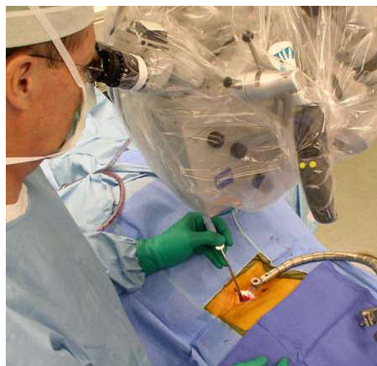
Fig. 1 Unilateral minimally invasive TLIF including insertion of interbody device and unilateral pedicle screws is completely performed through a single incision using a small closed working channel.

A thoracolumbar orthosis with sternal support was used for all patients for 12 weeks initially, which was later reduced to 6 weeks. Almost all patients were ambulatory within 2 hours. Radiographs were taken at 1 week and at 6 to 12 weeks (when the brace was removed). Followup included outcome evaluation through 3 months.