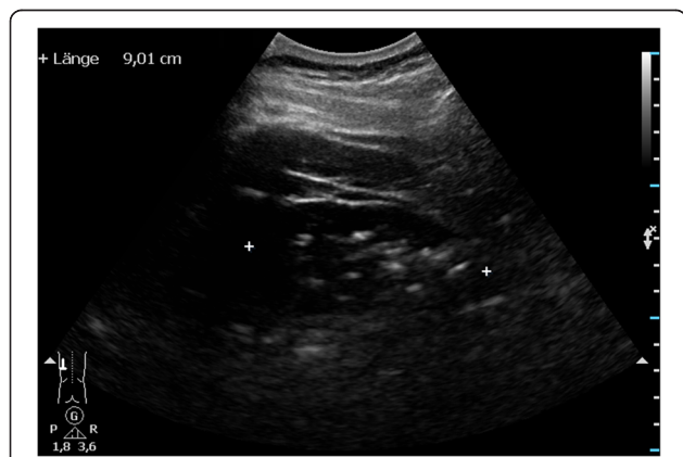
Figure 1 Very poor quality of ultrasound image of the kidney. The evaluation of reliable measurements of the kidney was unsuccessful due to severe gas artifacts.

Ultrasound, a routinely used bedside technique in clinical medicine, is not suitable to scan intraabdominal