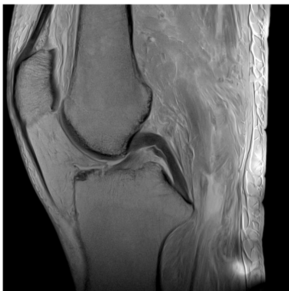
Figure 4 Very good quality of sagittal MRI image of the knee joint, skeletal and soft tissue structures are easily identifiable.

Plain x-ray techniques are preferred for a quick overview of skeletal structures as well as fluid accumulation in the lungs and distribution of gas content in the gut. In embalmed bodies this technique has a very limited use, even though mobile x-ray machines would allow imaging of human body donors right in the anatomical institute. In addition to severe gas artifacts, x-ray imaging was limited by the sagging of abdominal organs towards the spinal column due to the position of the body donors during fixation and storage. This prohibited the penetration of