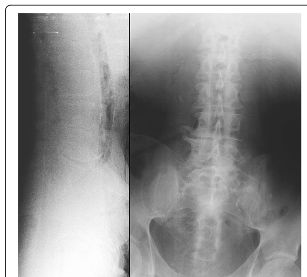
Figure 2 Poor quality of lateral and AP x-ray of the lumbar spine and pelvis. Due to the sagging of abdominal organs and additional gas artefacts in the abdominal aorta in lateral views scarcely any structures were identifiable, in AP views the lumbar spine and pelvic bones were poorly detectable.