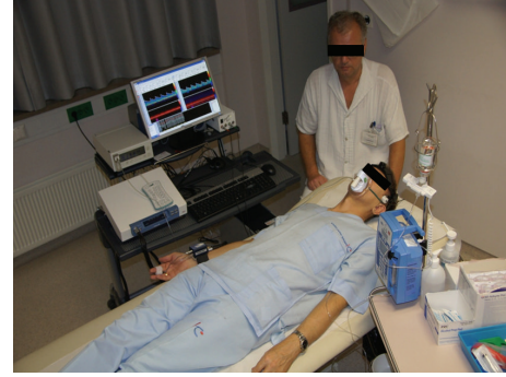
FIGURE 2: Cerebrovascular reactivity to L-arginine. The subject rests in a supine position. Two 2 MHz probes are immobilized by a handle on the subjects' head and v_m from both middle cerebral arteries (MCA) is recorded by TCD. Blood pressure and heart frequency on the right radial artery are monitored as well as CO 2 concentration in the exhaled air. All signals appear on the same time scale on the computer. Intravenous infusion of L-arginine is injected into the left brachial vein by a pump.

All the signals are preferably gathered on a single computer so that simultaneous assessment of all the parameters is possible. In case this is not possible time markers at the beginning and at the end of stimulation for each parameter are obligatory for later analysis.