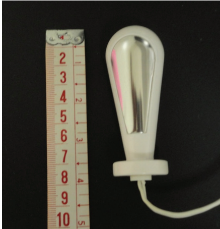
FIGURE 1: Vaginal probe used for recording myoelectric activity.