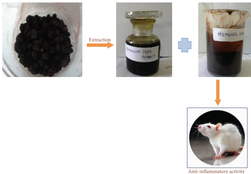
FIGURE 1: Schematic diagram of extraction and biological activity of the extract.

tissue. Experimental model of carrageenan-induced acute inflammation produces a range of inflammatory responses, due to the increase in the response to chemoattractants increasing PMN migration to the sites of inflammation [3].