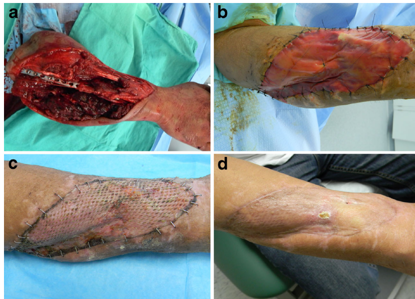
Fig. 2 A 48-year-old male sustained this injury while cutting a tree at work. a) The sharp end of the branch impaled the ulnar aspect of his arm. The patient sustained segmental loss of the median nerve measuring 8 cm, severe contusion of his ulnar nerve, a comminuted ulna fracture, and extensive muscle and tendon damage. This patient underwent multiple irrigations and

ten patients who underwent treatment of bone or tendon-exposed wounds with Matriderm® [24]. Nine of ten healed without the need for further reconstructive intervention. However, the authors concluded that functionality is not superior to traditional flaps for skin coverage. Cevelli et al. compared the use of Matriderm® with skin grafting versus skin grafting alone and noted more rapid re-epithelialization in the Matriderm® plus skin graft group at 2 weeks following