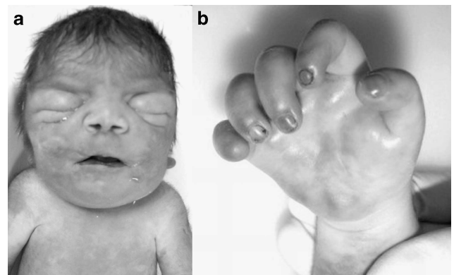
Figure 4 Affected newborn (patient 1) that died shortly after birth. (a) Facial photograph showing broad nasal bridge, a short nose, and a tented upper lip. (b) Hypoplastic fingernail of the index finger and aplasia of fingernail of the fifth digit.

of OFC are recognizable in our series; however, mild microcephaly as well as macrocephaly may occur.