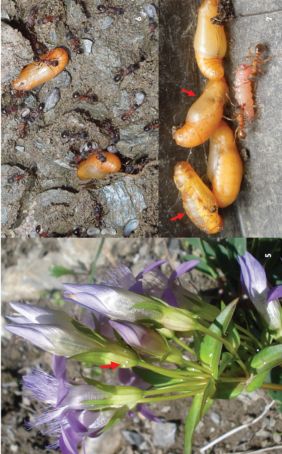
Figure 5–7. 5 Ma. rebeli eggs on Gentianella rhaetica at Prábichl 6 Ma. rebeli pupae under a stone in a Myrmica lobulicornis nest at Zeitzitz 7 Ma. alcon X pupae and a small larva found in Myrmica sabuleti nest at Sankt Ilgen, arrows sign infections with Ichneumon cf. enumerus (photo: AK).