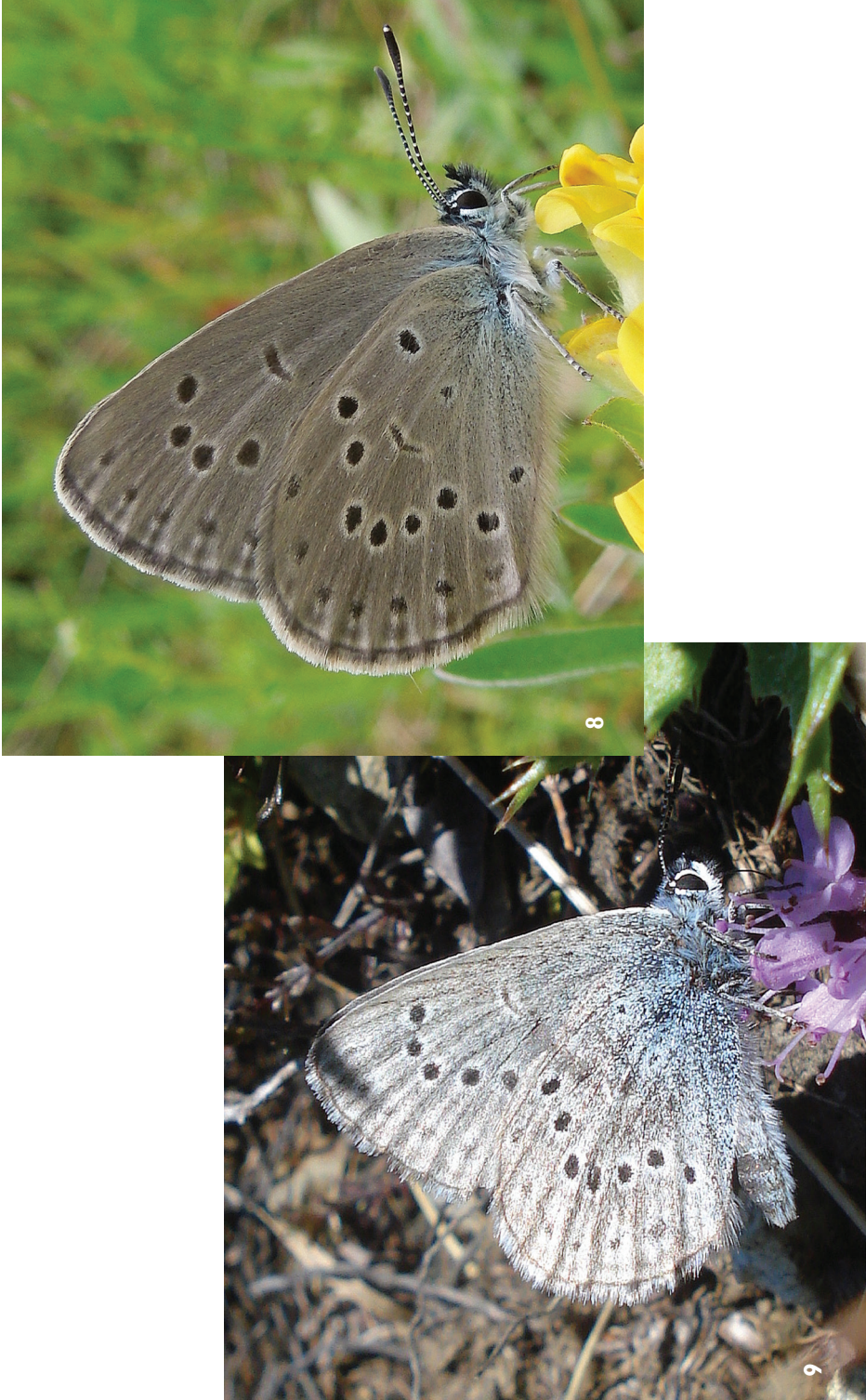
Figure 8–9. 8 Ma. alcon X (Hochschwab area) 9 Ma. rebeli (Hochschwab area).