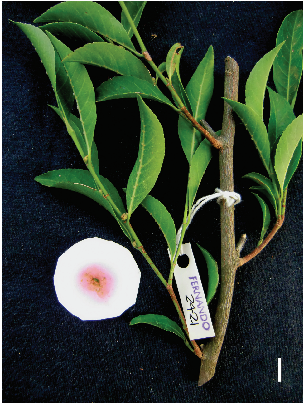
Figure 3. Rinorea niccolifera Fernando, shown as a nickel hyperaccumulator by a field test using filter paper impregnated with 1% dimethylglyoxime dissolved in 95% ethanol. Scale bar = 10 mm. Fernando 2421 (LBC).